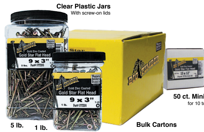
5 lb. 1 lb. Bulk Cartons